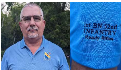
Figure 1 Left Sleeve

Bill Burt has information on the purchase of 52 nd and 6 th Infantry logo clothing and hats.