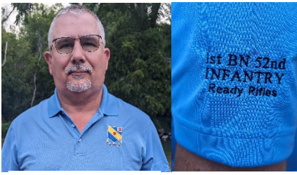
Figure 1 Left Sleeve